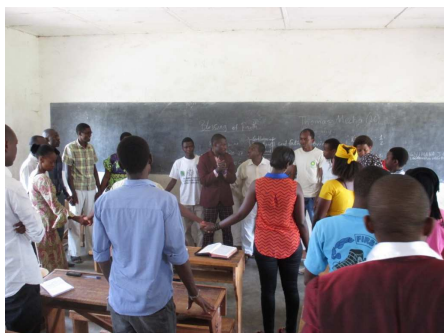
Deaf people praying together after a Sunday Service before dismissal