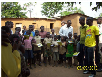
Family photo of some of the beneficiaries of school material

CCW organised a seed project for Ruziba community last September 2013 while missionaries Marjorie and Allan were visiting Burundi. The so-called project consisted of a donation of a football provided by the missionaries to youth and a donation of school material from CCW and from Ruziba youth. A number of pupils and students benefited the donation! Let us notice that youth from that area received a donation of goats previously as a means of income generating activities for them to develop a spirit of team work and for their sustainable development.