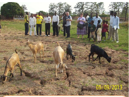
Goats donated to Ruziba youth to sustain Healing, Peacebuilding and development

Gratitude: We are thankful to whoever contributes in one way or the other to bring hope to the desperate from Burundi! May God bless you abundantly!