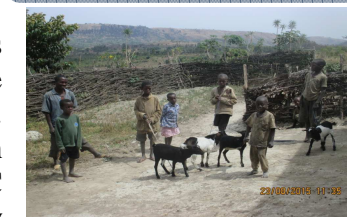
Goat donation to poor families at Goat farm