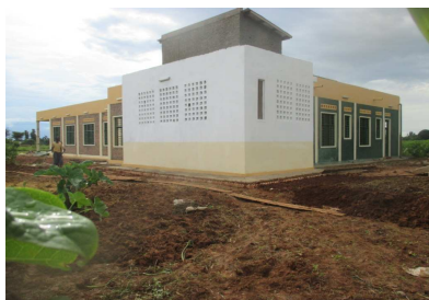
Archive: South & East view of Mbabazi clinic