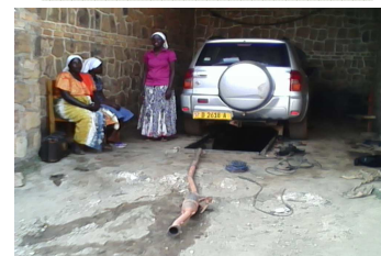
Fixing the CCW RV4 in a garage in Ruyigi City