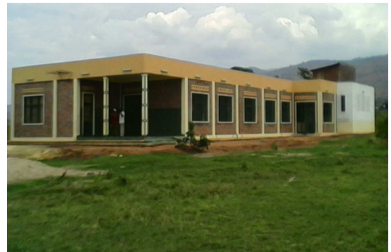
Archive: View of Main façade of Mbabazi clinic

The year 2015 was very blessed for our ministry as we achieved great things: a completion of construction of the clinic and a provision of medical equipment partly. 1 This step forward was made possible thanks to every kind of unceasing support from prayer partners and friends who you are. CCW Staff members and beneficiaries express our genuine gratitude to all of you!