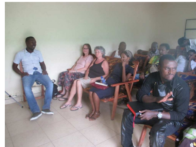
Archive: Part view of Deaf people fellowship, in Burundi