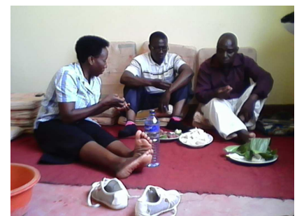
Prayer day: Three of CCW staff during lunch time

CCW staff met on 21-22 last November at Mbabazi clinic to pray together for more effectiveness of our ministry, to evaluate the need for our clinic and to pray for peace to be restored in Burundi fully. Once the clinic is supplied with water we can start running the clinic with a minimum of services as we already have a minimum of medical equipments. This would be a first aid unity- a kind of dispensary - to save lives of sick desperate poor Burundians who are in need of assistance in health care now. A minimum of $16,033.00 to purchase initial medications and $ 12,000.00 to purchase more medical equipments and furniture and $ 5,186.00 per month as staff reserve is still needed.