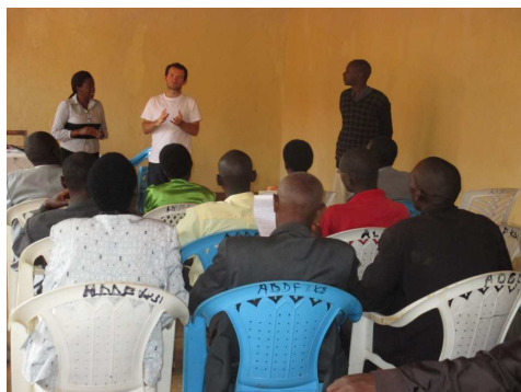
Partial view of the participants to the follow up seminar on 27 th March 2014 in Karusi